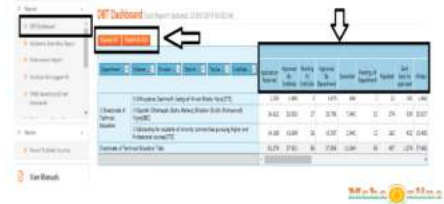
Allotment Datewise Report